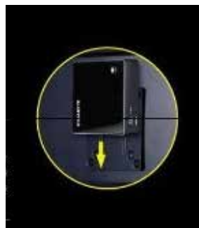
Flexible mounting options

For more information, please contact your local sales representative or contact Continental Access directly at (631) 842-9400.